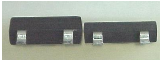
Figure 3. Comparison of Present and New Packages