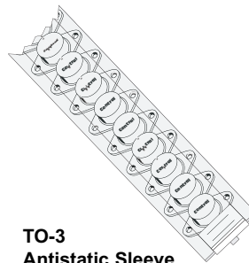
TO-3 Antistatic Sleeve